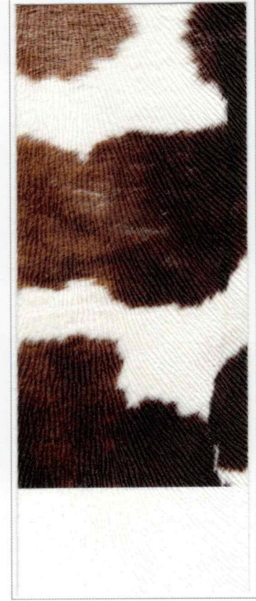
Latex ink printing